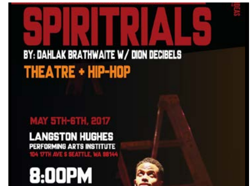
SPIRITRIALS, BY DAHLAK BRATHWAITE