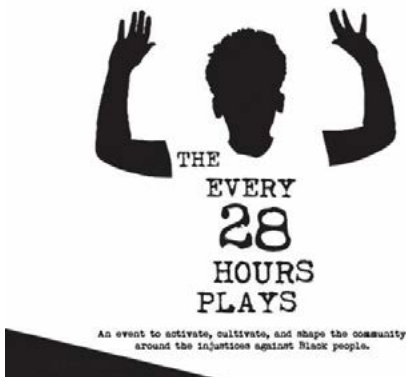
THE EVERY 28 HOURS PLAY, BY VARIOUS ARTISTS