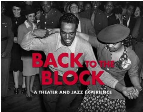
BACK TO THE BLOCK, BY CD FORUM, NAAM, & MOHAI