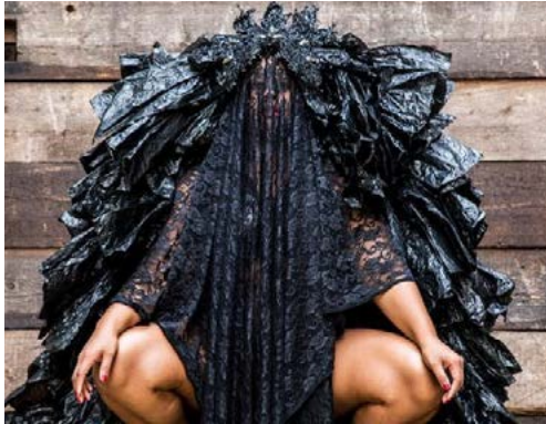
THE BAG LADY MANIFESTA, BY TAJA LINDLEY